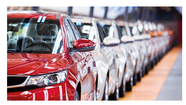
End-of-line testing of radar sensors.