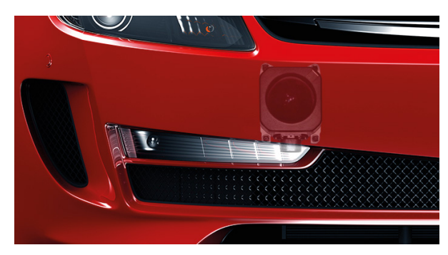
Radar sensor tests under the influence of surrounding components.